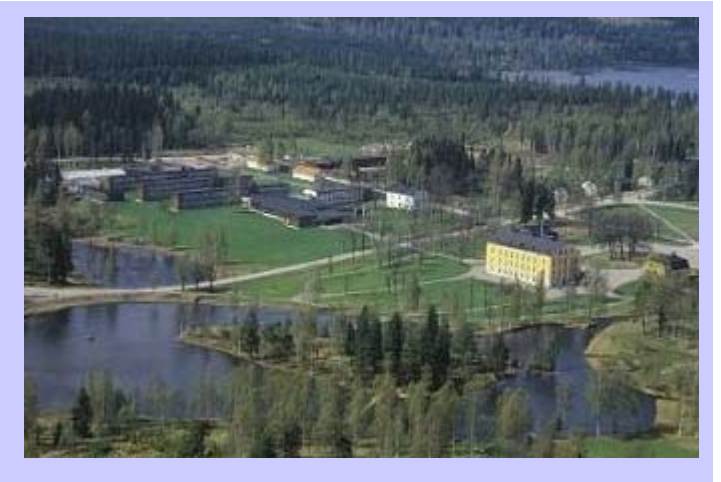
Garpenberg Skogshögskolan (Sweden)

The students develop their Applied Period with partner organisations from business, research and administration throughout the European Union.