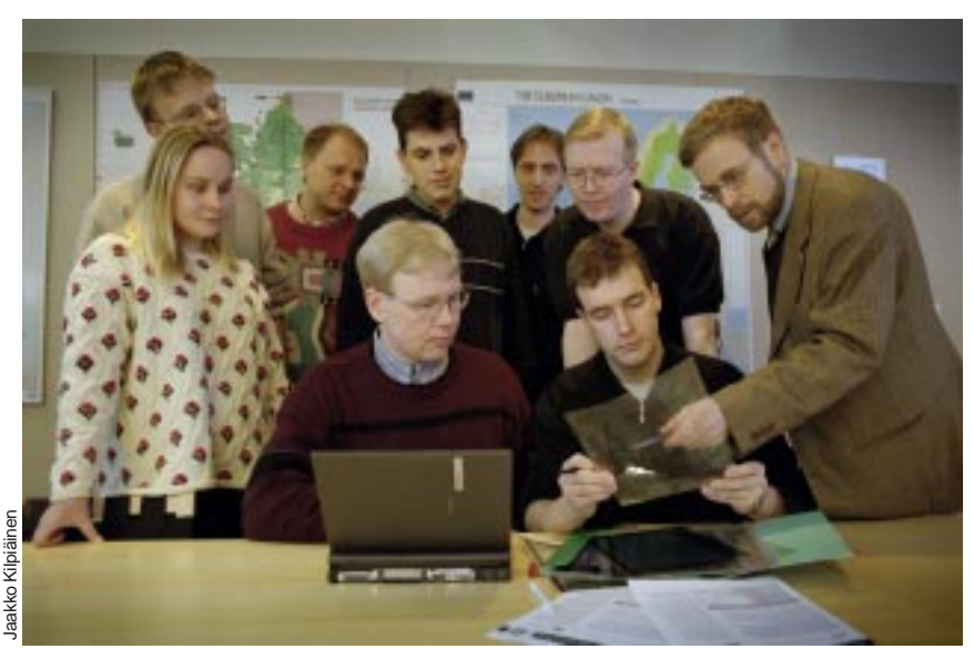
Problem solving in groups is an important teaching method in the MSc EF -Programme.

The MSc European Forestry Programme provides an additional dimension to the existing educational markets for forestry and environmental management in Europe. The focus of the Programme will be on trade and policy issues, supported by a sound understanding of the variety of European ecological conditions and their dynamics. The curriculum of the Programme is designed to take into account the needs of potential employers.