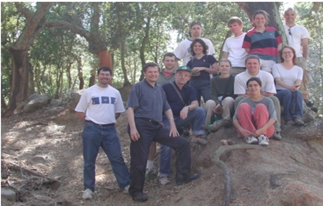
MSc EF students and lecturers in cork oak plantation in Catalonia, Spain.

The other students have spent their Applied periods with various organisations from Consultants; FEG oy Joensuu Finland, to research at the European Forestry Institute.