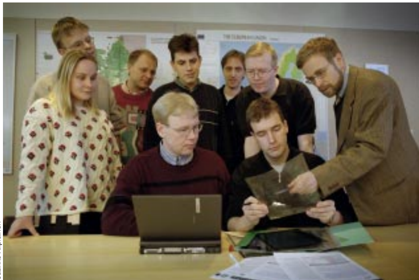
Problem solving in groups is an important teaching method in the MSc EF -Programme.

The MSc European Forestry Programme provides an additional dimension to the existing educational markets for forestry and environmental management in Europe. The focus of the Programme will be on trade and policy issues, supported by a sound understanding of the variety of European ecological conditions and their dynamics. The curriculum of the Programme is designed to take into account the needs of potential employers.